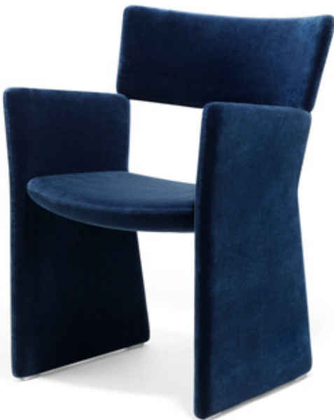
Crown chair by Chris Martin for Massproductions from Simon James