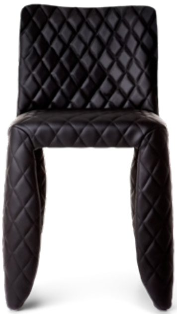
Monster Chair by Marcel Wanders for Moooi from ECC