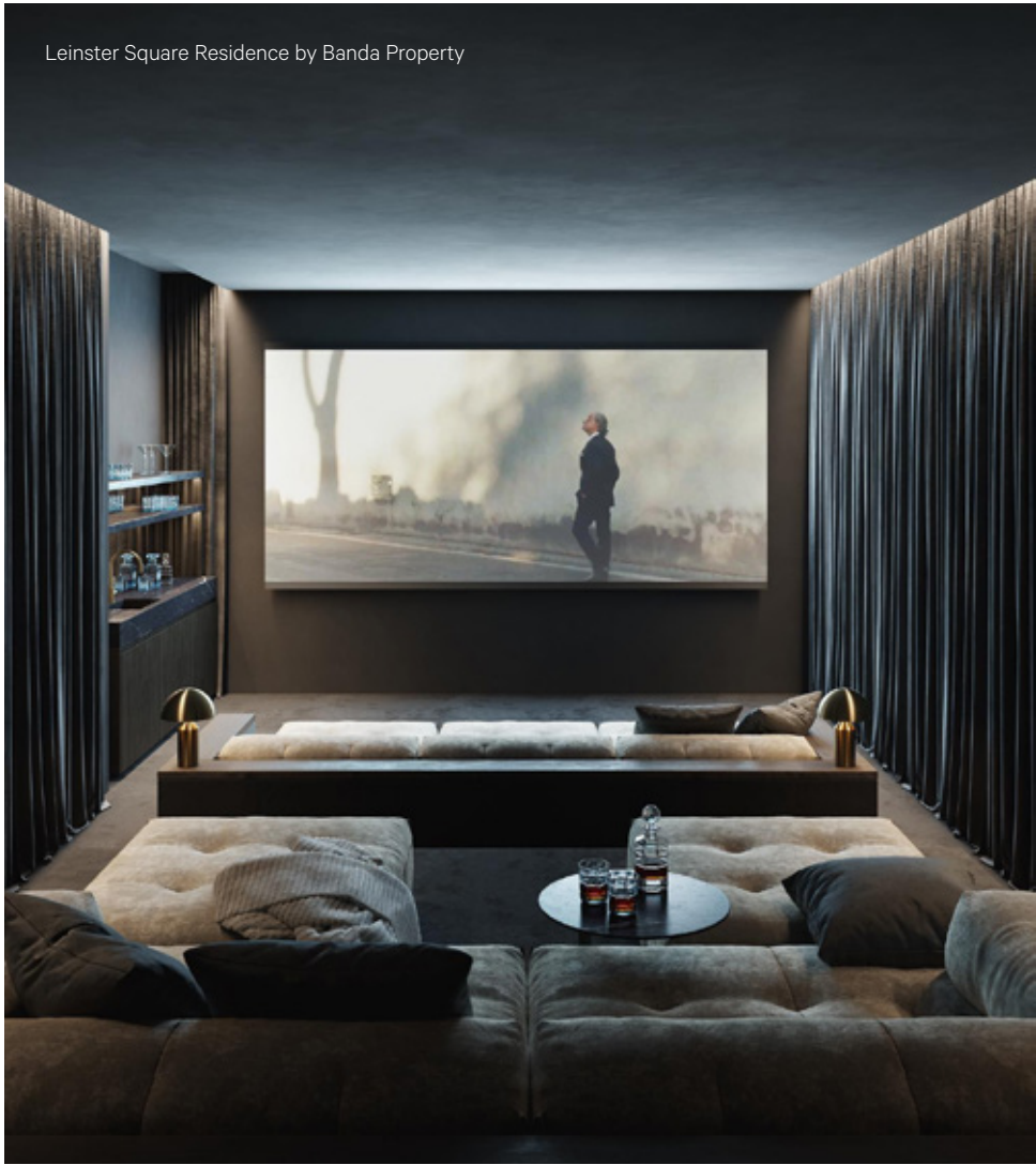
Leinster Square Residence by Banda Property

Make movie night at home a luxurious affair with a darkened room, a large screen and of course, a suite of plush armchairs and sofas to sink into.