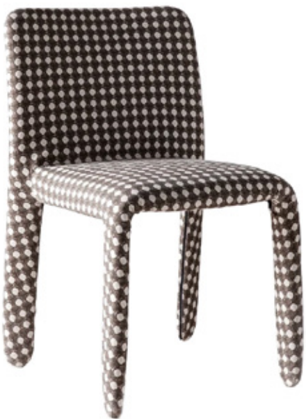
Glove Up dining chair by Patricia Urquiola for Molteni&C from Dawson & Co.